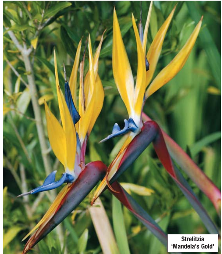
Strelitzia 'Mandela's Gold'

Again, after a number of years of waiting for the stocks to increase, Thompson & Morgan is now delighted to be able to offer this stunning variety to gardeners. They now have the chance to grow and experience the flamboyant, golden yellow and purple blooms. As these plants have all been hand-pollinated, customers can be 100% certain that their seed is pure yellow.